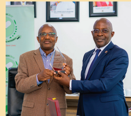
Strengthening Health Partnerships Together: Highlights from recent partnership visits with some of our valued collaborators. Front row (left to right): UNBS, Uganda Healthcare Federation, and TASO. Second row (left to right): Population Services International (PSI), Nsambya Hospital National Drug Authority (NDA).